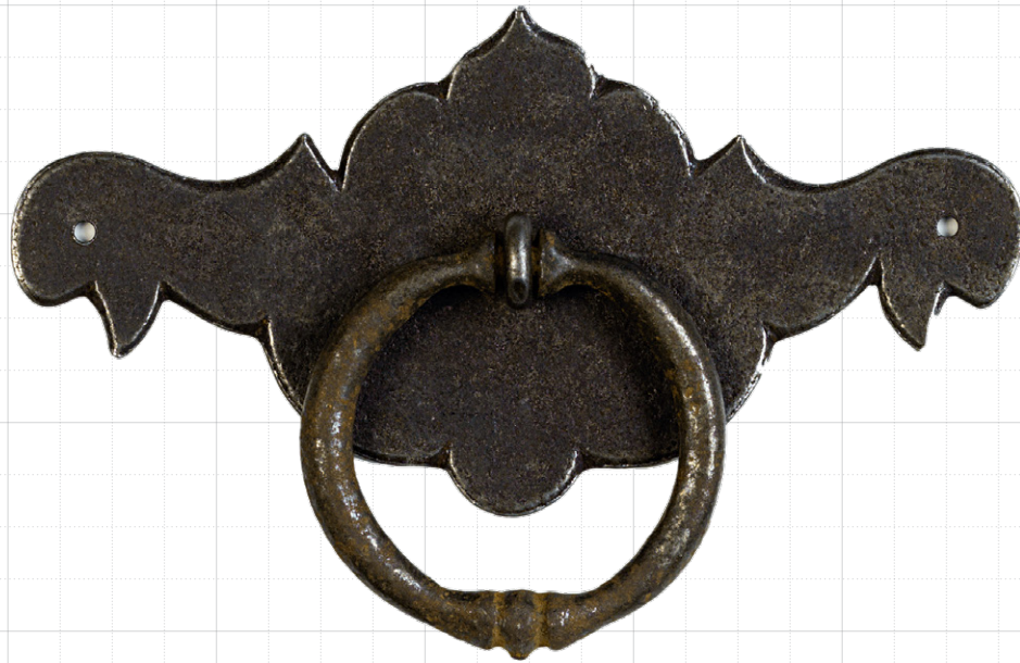
Le Blanc Pull