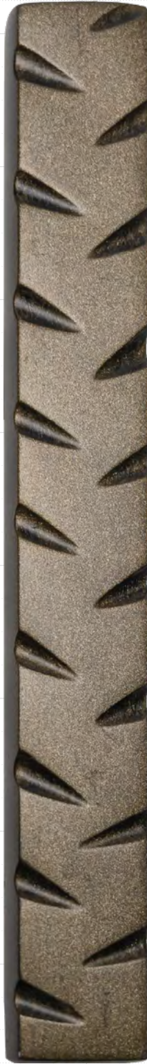
Lottie Pull SHOWN IN: NEW BRONZE