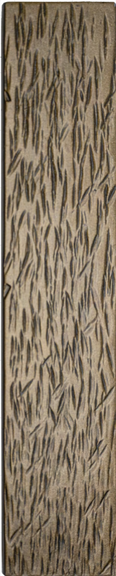
Ridley Pull SHOWN IN: NEW BRONZE