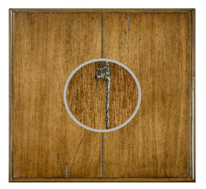
MEDIUM DISTRESSING (May contain: Scratches, Light Chisel Marks, Nicks, Dents, & Worm Holing)