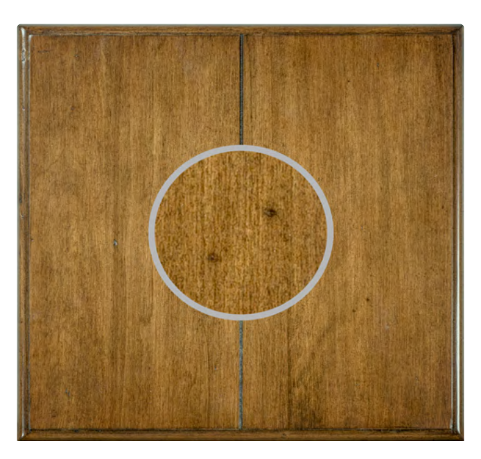
LIGHT DISTRESSING (May Contain: Nicks & Dents)