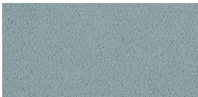
High Cotton JADE

CLEANABILITY Water-based cleaners may be used.