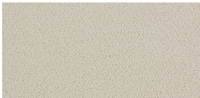
High Cotton KHAKI